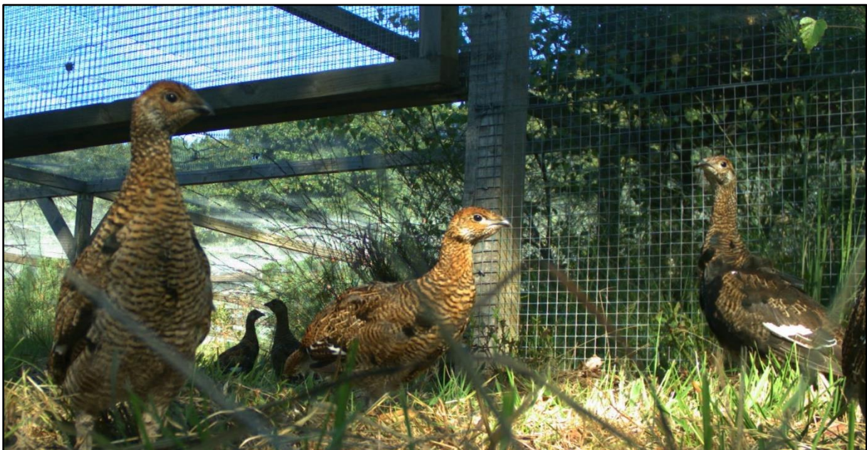
FIGURE 1. PICTURE JUST AFTER THE RELEASE.