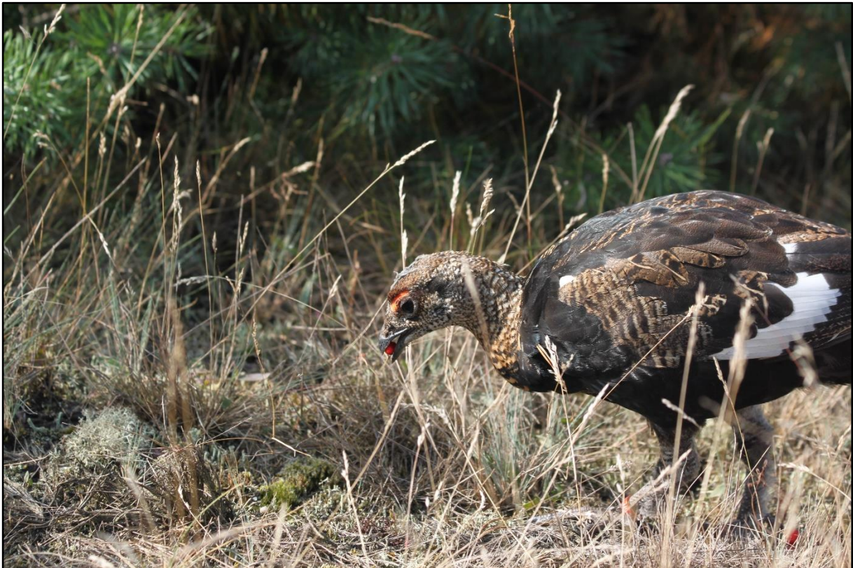
FIGURE 2. BLACK GROUSE JUST AFTER RELEASE