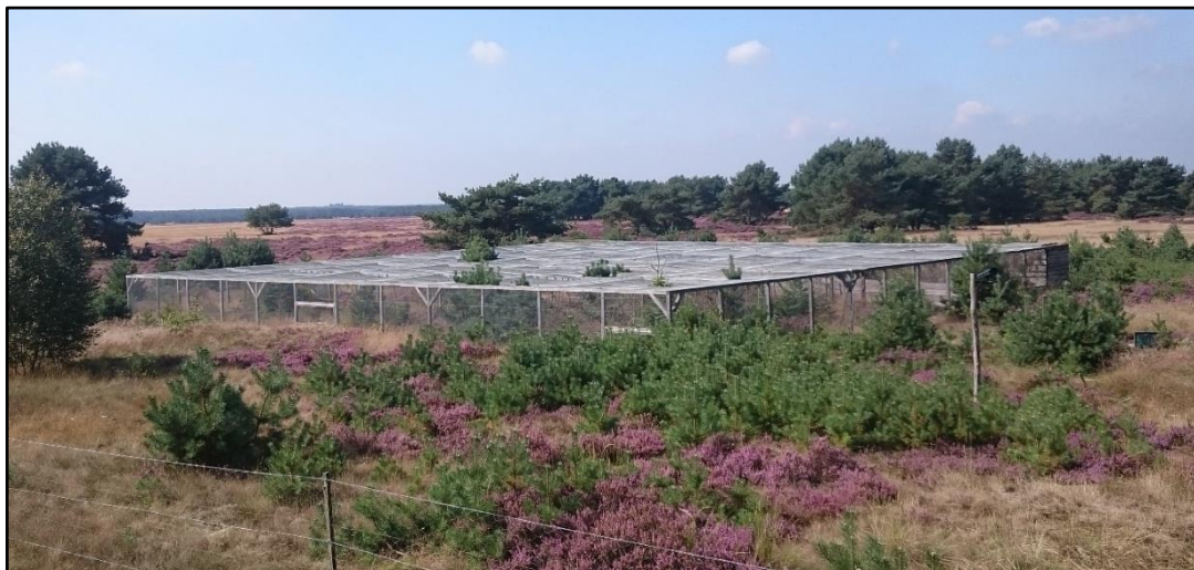
FIGURE 3. SOFT-RELEASE CAGE AT LOCATION STAF